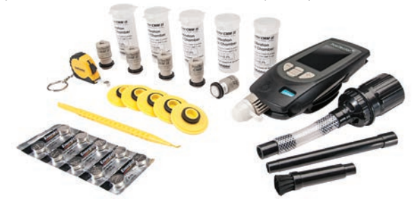
PosiTector CMM IS Pro Kit includes the PosiTector DPM Advanced

Replacement chambers, salt solutions, tools, caps, stackable probe extensions, and fins are available upon request